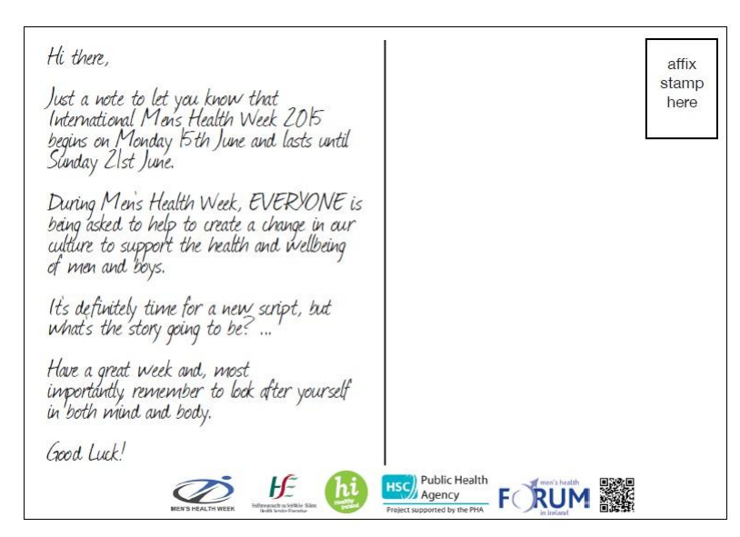
Text side of MHW 2015 Postcard